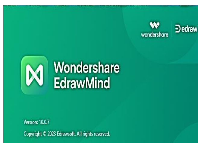
Figure 1. Appearance of EdravMindMaster program.

Below we have given an example of using EdravMindMaster, an application for creating Mind maps, to implement the principles of exhibitionism when providing theoretical knowledge on subjects related to the African continent from the discipline of "geography". To do this, the program is first launched (Fig.1).