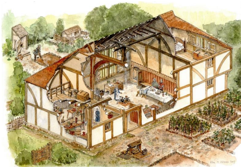
Pic. 1. Fachwerk. Germany 15th century.

Narrow high roofs also contained living quarters, they were decorated with balconies-bay windows, which gave the house a special charm.