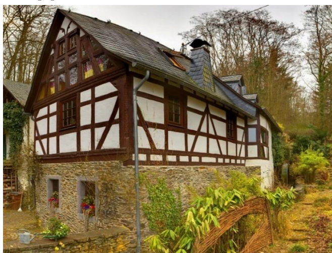
Pic. 2. Vintage (fachwerk) half-timbered house in the Czech Republic

To expand the space in the room, enterprising Germans came up with the idea to build so that each floor was wider than the previous one and "hung" over it by about half a meter. This overhanging floor also protected the lower ones from moisture. Subsequently, the characteristic protrusions became one of the distinctive features of the fachwerk as an architectural trend. XIII – XIV centuries in Europe, frame construction received a special development. The gradual accumulation of construction experience, the improvement of carpenters' skills (this was helped by the development of shipbuilding), as well as the desire to save wood and other factors led to the appearance of the fachwerk construction method in Germany in the XV century. The German name of such houses suggests that such structures were built only in old Germany. However, this is not the case at all. Old fachwerk buildings can be found in Holland, Austria, Switzerland, in Scandinavian countries, even in France where such a technique was called "colombage". In England, they also built houses with a wooden frame: they were called "half-timbered" or "timber-frame". [5]