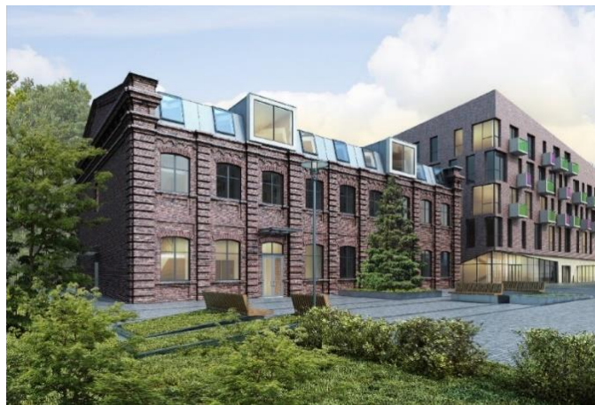
Pic. 4. Schmidt Mill Saratov renovation

In the second half of the XIX century, the rapid development of capitalism in Russia, the abolition of serfdom and the desire of newly enriched merchants, industrialists of non-noble origin, wealthy officials and successful intellectuals to feel like landlords - brought to life new types of individual housing - a country mansion (year-round residence) and cottages (seasonal residence).