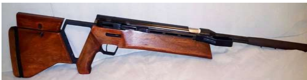
Figure 2. IJ-32 air rifle

Despite the use of the same principle of operation, the design of the main components of this rifle includes a number of important differences. Preparation for firing is done only by turning