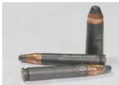
Figure 5. Half-shot

The shells are made of mild steel and consist of a lead core and shell covered with a lump to protect against corrosion. If the core is steel, there is a thin lead coating between it and the shell to cut the shaft and extend the service life of the pipe duct.