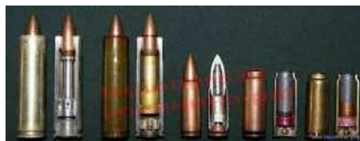
Figure 6. Special arrows

The hemispheres consist of a lead core and a shell that do not completely cover the shafts. He is naked and the top of his nose remains. This is done to increase the harmful effects of the bullet.