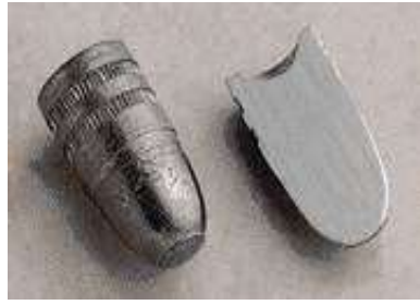
Figure 3. Bulletless shell

The shells are made of the same material, have a large weight and are good at deformation when touched. The best material for bullets is lead, with additives. Such bullets are used for small-caliber weapons, 4.5-5.6 mm - for both firearms and pneumatic. Their flight speed does not exceed 400 m / s. Steel bullets for air guns are prohibited.