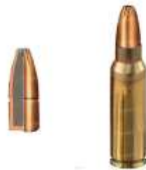
Figure 4. Cable arrow

The shells are made of the same material, have a large weight and are good at deformation when touched. The best material for bullets is lead, with additives. Such bullets are used for small-caliber weapons, 4.5-5.6 mm - for both firearms and pneumatic. Their flight speed does not exceed 400 m / s. Steel bullets for air guns are prohibited.