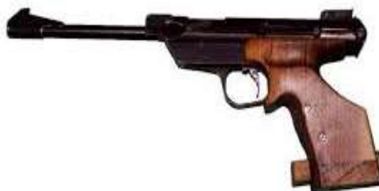
Figure 1. IJ-33 air pistol